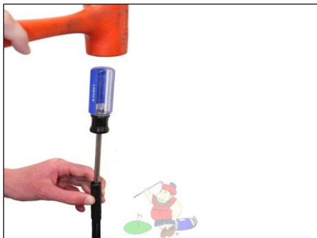
Fig. 1 Dry Fit

Dry Fit Method Insert the ext. in the shaft butt. And simply tap the plug until you reach the resistance you need. Note* don't go too far as you may have trouble removing the extension. You can remove the extension to apply the epoxy