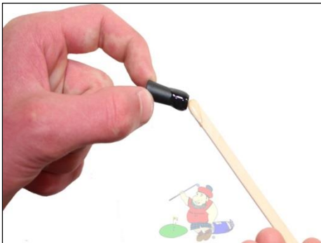
Fig. 2 Wet Fit

When dry fitting the shaft you may need to sand the top collar if needed this will give it the proper depth insertion